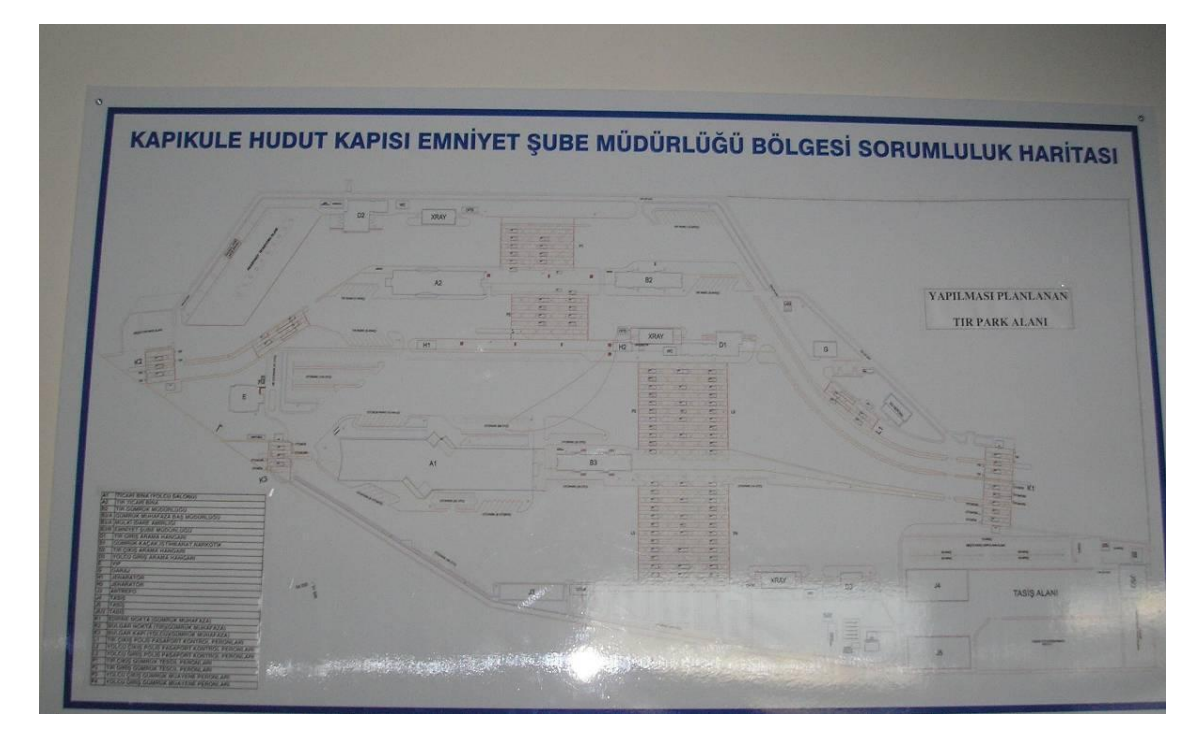
Figure 3. Map of Kapıkule BCP