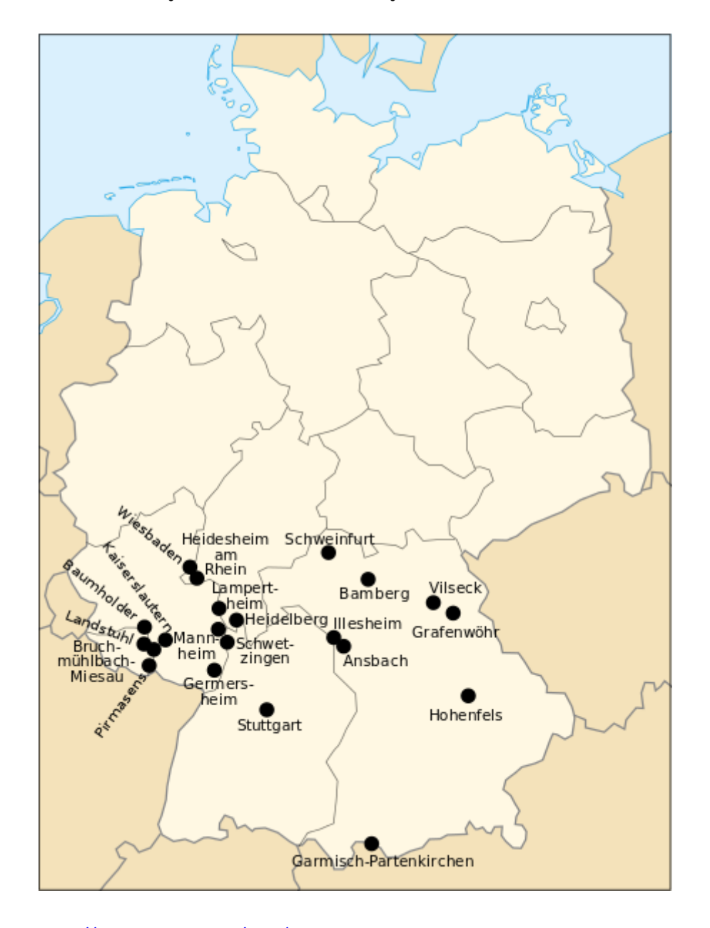
Figure 2- US Military Existence in Germany