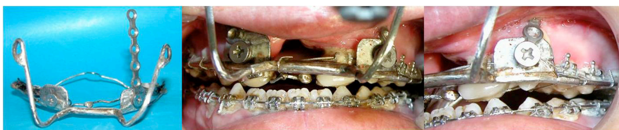
Figure 3. Modified intra oral appliance of the RED system.