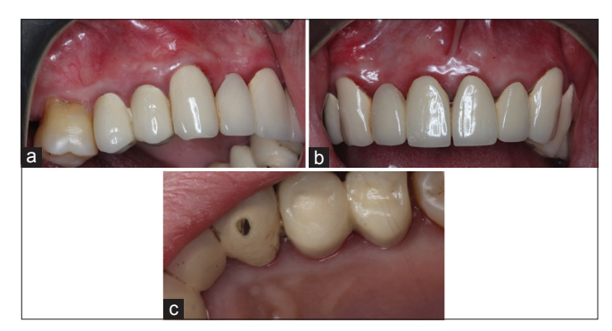
Figure 3: (a-c) The appearance of gingival tissues after the treatment of Actinomyces-associated lesions

and attachment loss which were the symptoms of chronic periodontitis. The fact that he used 3 bottles of chlorhexidine-based mouthwash for 2.5 months might have affected the integrity of the tissue and compromised the defense mechanism. As a result, Actinomyces has seeded deep in the gingival tissue and led to disease.