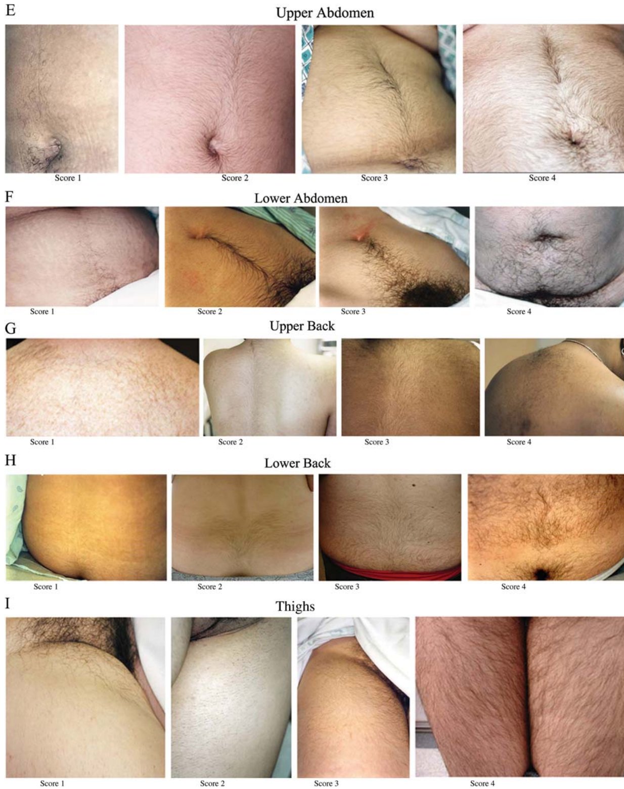
Figure 3 Continued

It is possible that not all body areas evaluated have the same discriminatory power to detect hirsutism; the upper lip, chin, and lower abdomen were observed to be the most discriminatory zones (Lunde and Grottum, 1984; Derksen et al. , 1994). In a study of 675 consecutive hyperandrogenic patients using the mFG method, we also observed that a hair growth score of \geq 2 on the chin or lower abdomen only was found