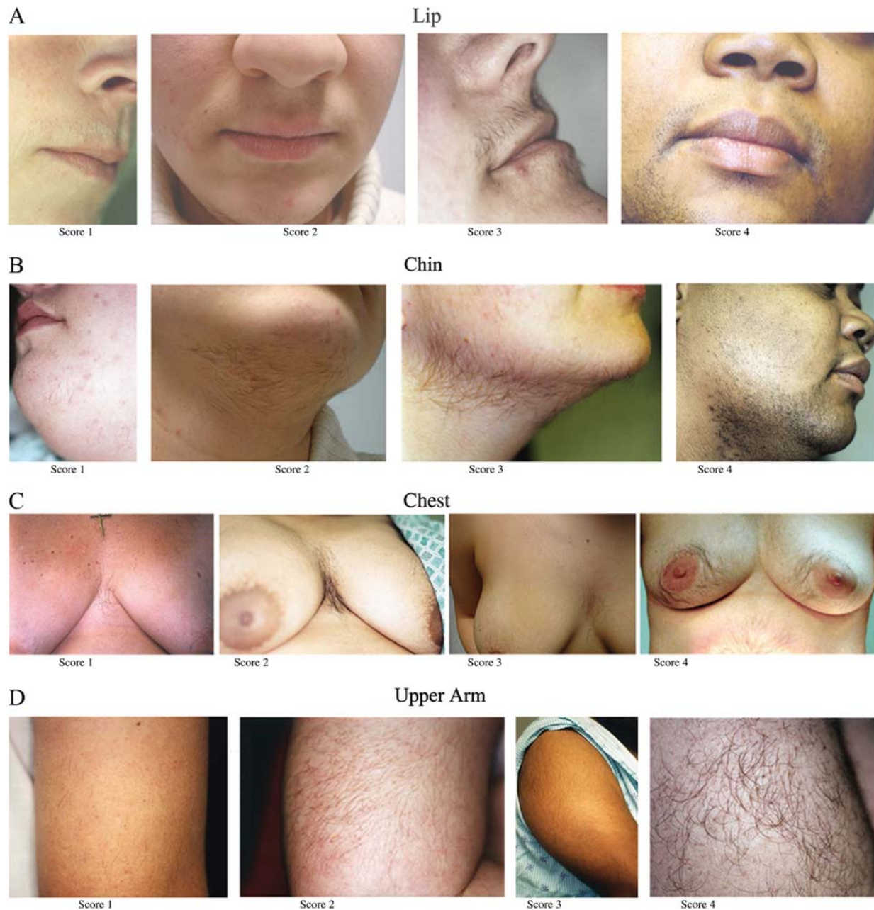
Figure 3 Photographs depicting facial and body terminal hair growth scored according to the modified FG method.

All were taken on women who had not used laser or electrolysis for at least 3 months, not depilated or waxed for at least 4 weeks, not shaved or plucked for at least 5 days before the photograph. The photographs depict scores of 1 through 4 for the upper lip ( A ), chin ( B ), chest ( C ), arm ( D ), upper abdomen ( E ), lower abdomen ( F ), upper back ( G ), lower back ( H ) and thighs ( I ). The areas were photographed with a standard single-lens reflex camera (Nikon N50, Nikon Corp, Melville, NY, USA) equipped with a macro lens (Vivitar 50 or 100 mm Auto Focus Macro, Vivitar Corp, Newbury Park, Calif) and ring flash (Vivitar Macroflash 5000, Vivitar Corp). For film, Kodacolor VR 200 ISO film (Eastman Kodak Co, Rochester, NY, USA) was used. Representative areas were selected. All photographs of hair were anonymized and all identifying information removed, meeting current Institutional Review Board for Human Use and Health Insurance Portability and Accountability Act of 1996 standards. Higher resolution versions of these images are available as Supplementary data.