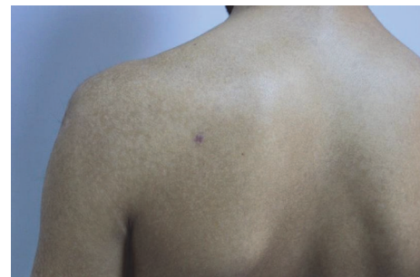
FIGURE 3: The appearance of the left upper back and the left upper arm after 2 months of the treatment.

keratosis (Figure 3). No major side effect was seen related to the use of acitretin.