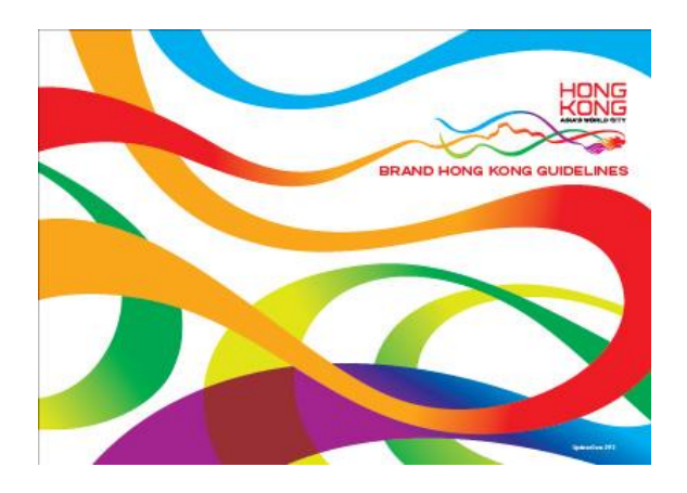
Figure 5. Hong Kong Brand Logo. ("Brand Guidelines", 2016.)

In June 2015, government initiative "Brand Hong Kong" (BrandHK) launched the "Our Hong Kong" campaign to promote Hong Kong's soft strengths, achievements and aspirations while reinforcing Hong Kong's core values and attributes. Through authentic stories, the campaign invited global audiences to experience Hong Kong themselves with the tagline: "This is Our Hong Kong. Why not make it yours?" The visual identity in this case displayed the primary associative array - the dragon as a cultural and traditional symbol, which rushes into the future (see Figure 5).