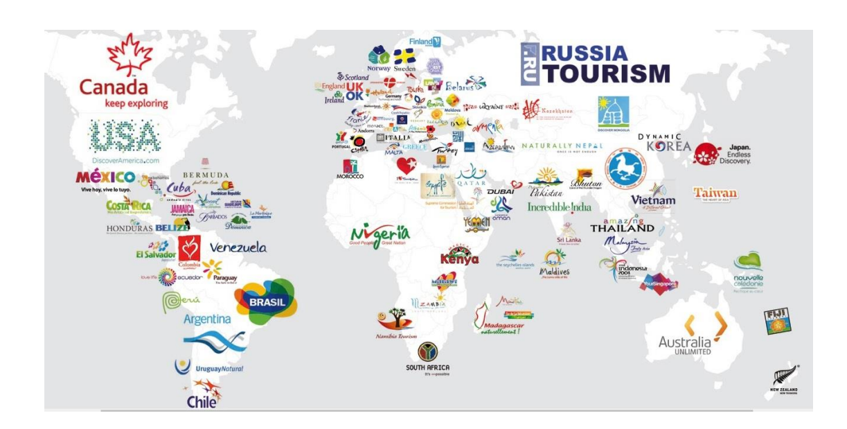
Figure 2. Tourism Logos World Map. ("Leisure and Tourism", n.d.)