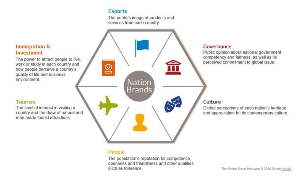
Figure 1. The Nation Brand Hexagon. ("About NBI", 2017)

This model structures the concept of place brands' identity and is one of the most demonstrative models that explains main components of the national branding.