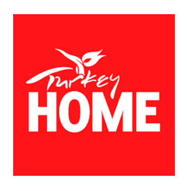
Figure 8. Turkey Home Logo

To promote the tourist and cultural image of Turkey, the Ministry of Culture and Tourism of Turkey in 2014 created the campaign Turkey Home. The main goal of this campaign is to create a strong bilateral relationship with the tourist audience to increase awareness of the great historical and cultural heritage of Turkey, both about its traditions and about the features of social and everyday life.