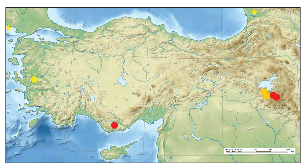
Figure 3. Distribution of the taxa. (square) Crataegus azarolus var. senobaaensis ; (star) Crataegus monogyna var. odemisii var. nov. (circle) Crataegus yaltirikii (Near East topographic map-blank.svg).

by Christensen (1992). In C. monogyna , extensive variations in leaf morphology and indumentum are present, whereas variations in fruit colour are limited. Fruit colour of C. monogyna is clearly red and/or with degrees of red. Specimens of the new variety, C. monogyna var. odemisii are yellow. Red and various degrees of red colour for fruit of infraspecific C. monogyna taxa have been observed by the second author and they have hundreds of representative specimens for these fruit colours in the above-mentioned herbaria. According to observations on the fruit colour of single pyrened Crataegus taxon, it is a constant character and unique in the infraspecific taxa of C. monogyna . Hence, it is worthwhile accepting this population as a separate taxonomic status, as a variety.