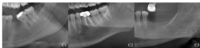
Fig. 1. Examples of the mandibular cortical index (MCI) classification (C1, C2 and C3)

For the intra- and inter-observer reliability, 40 samples were randomly selected and the MCI measurements were reassessed over a distance of 2 weeks.