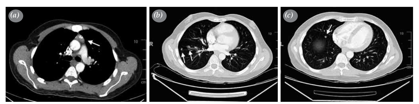
Figure 1. (a) Thoracic computed tomography revealing a partially calcified thymic mass and (b, c) an additional three lung nodules in lower lobe.

Thymic carcinoid tumors, which usually occur in the third or fourth decade of life, are associated with