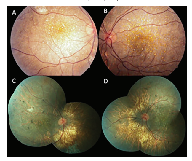
Figure 1. Color fundus images: In 2008, extensive intraretinal crystals concentrated around the posterior pole and relatively little chorioretinal atrophy were observed in the right (A) and left (B) eyes; In 2018, there was a marked decrease the number of crystalline deposits and increase in chorioretinal atrophy in the right (C) and left (D) eyes

Hirashima et al.<sup>5</sup> used SS-OCTA to evaluate 9 eyes of 9 patients with BCD, 16 eyes of 16 retinitis pigmentosa patients with EYS mutation, and 16 eyes of 16 control subjects. The outer choroidal vascular area was 43.34\pm5.76\% in eyes with BCD, 53.73\pm4.92\% in eyes with EYS mutation/retinitis pigmentosa, and 52.80\pm4.10\% in healthy subjects, with the value in BCD