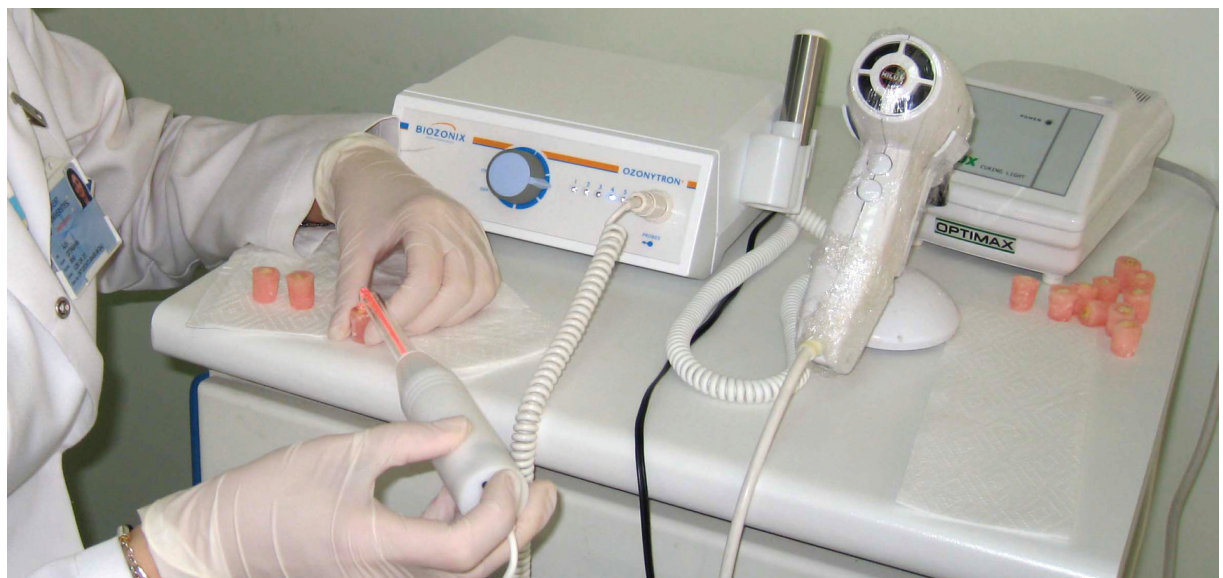
Figure 2. Application of Ozonytron.