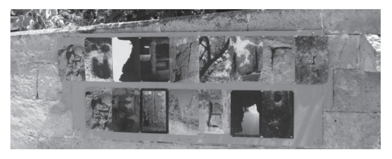
Figure 2. The image G, Ü, Z, E, L, Y, U, R, T and G, E, L, V, E, R, İ writing gathered by putting letters side by side.