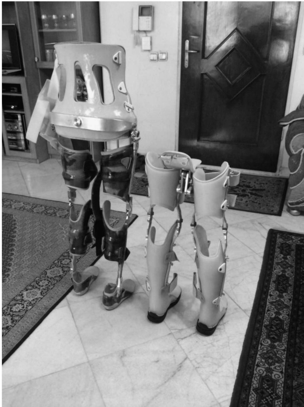
Figure 1 New MRGO and IRGO.