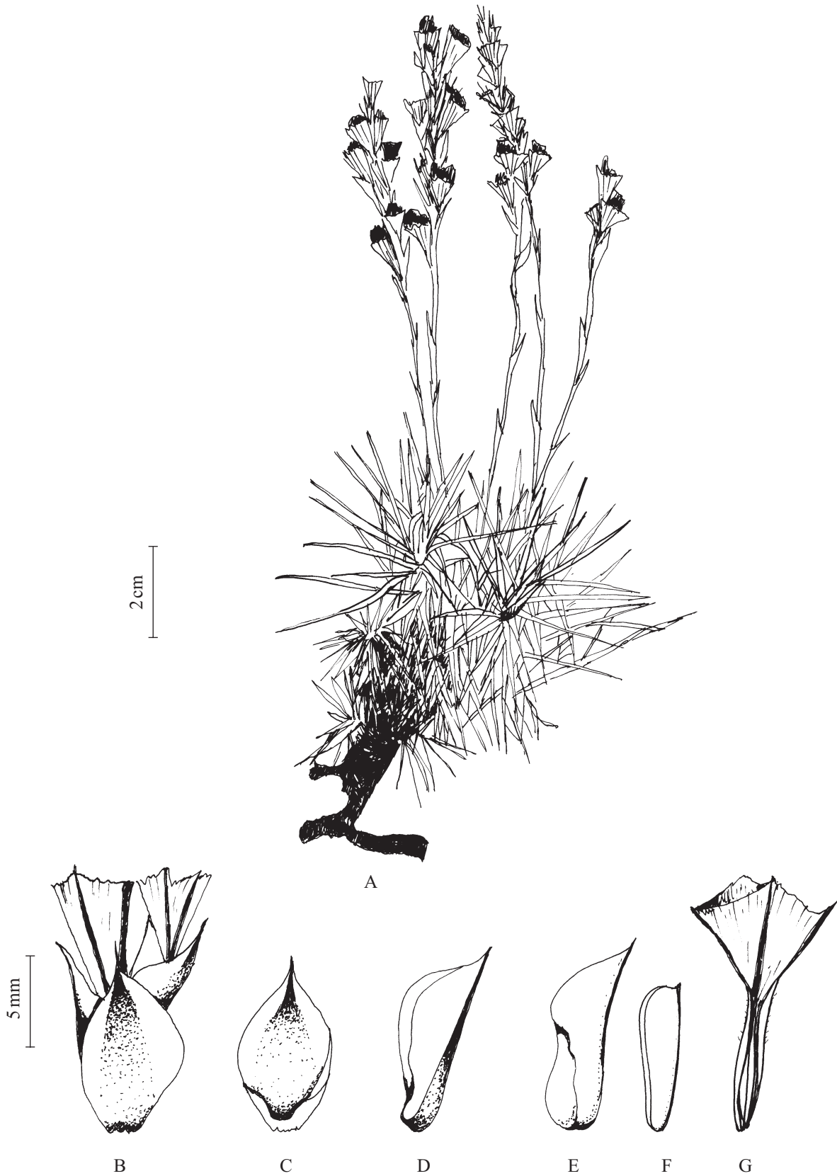
Figure 3. Acantholimon hoshapicum sp. nov. A, habit. B, spikelet. C, outer bract. D–F, inner bracts. G, calyx.