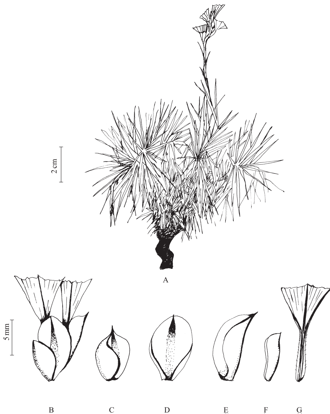
Figure 1. Acantholimon bashkaleicum sp. nov. A, habit. B, spikelet. C, outer bract. D–F, inner bracts. G, calyx.

(?densis), spicis 8–10 (?16) spiculis abbreviati-congestis compositis, spiculis 2-floralibus 12–13 mm longis, bracteis floralibus externis brevioribus 9–10 mm longis glabrescentibus hyalino-marginatis, bracteolis internis 3 aequilongis 8–9 mm longis hyalinis, calycis limbis 6–7 mm diametro, nervis limbi marginem attingentibus.