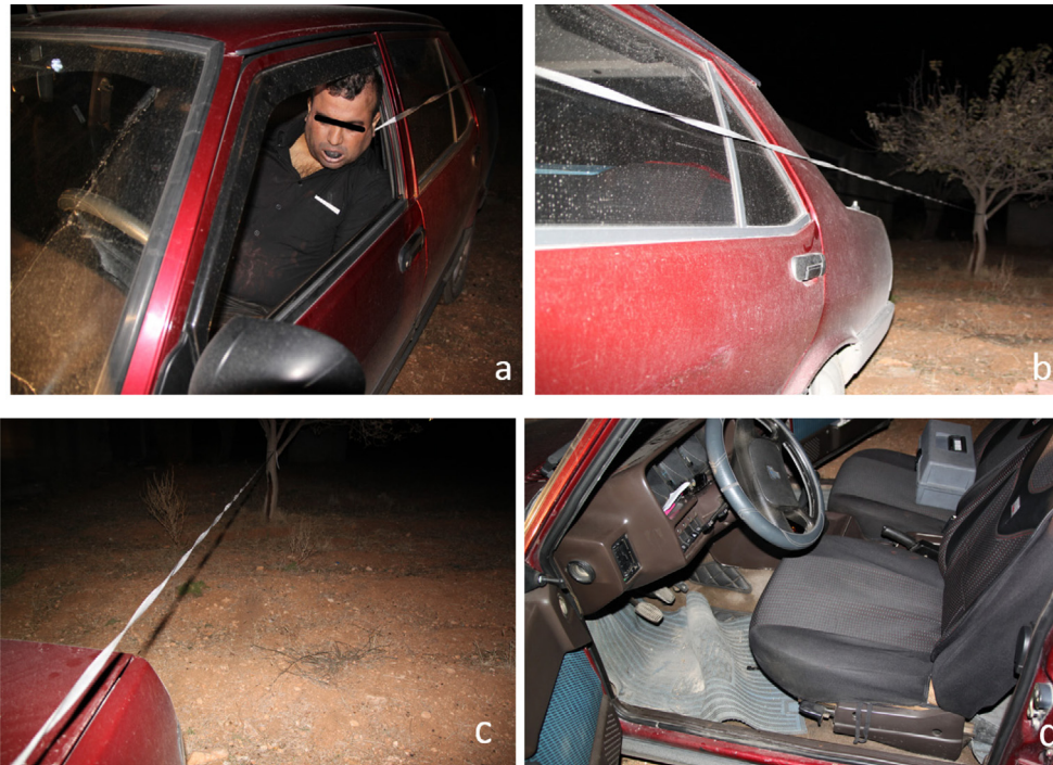
Figure 1 (a-d) Scene of death.

At external examination there was a ligature mark, with 1 cm width, gently sloping upward toward the notch at left side of occipital region (Fig. 3a and b). Additionally, multiple wrist-cuts of approximately 5 cm in length were noticed on anterior side of both wrists (Fig. 4a and b). The wrist cuts were