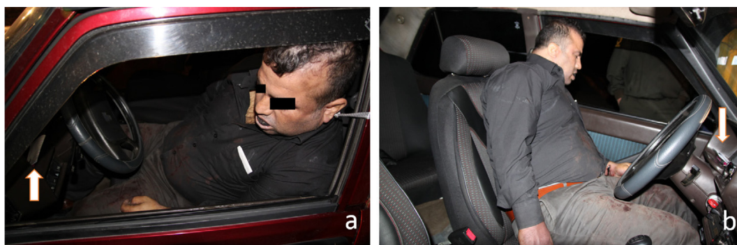
Figure 2 (a and b) Blood on shirt and trousers, and suicide note (arrows).