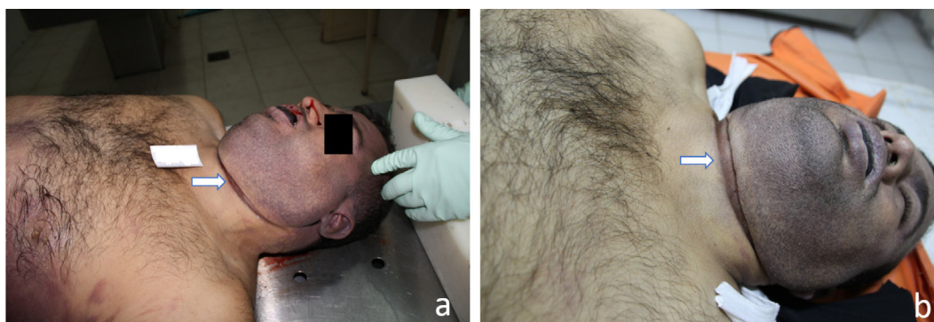
Figure 3 (a and b) Ligature mark (arrows).