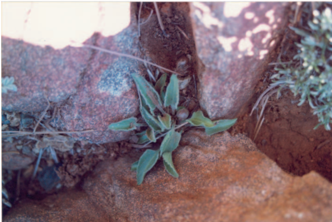
Figure 3. Viola yildirimli in the wild – fruiting.