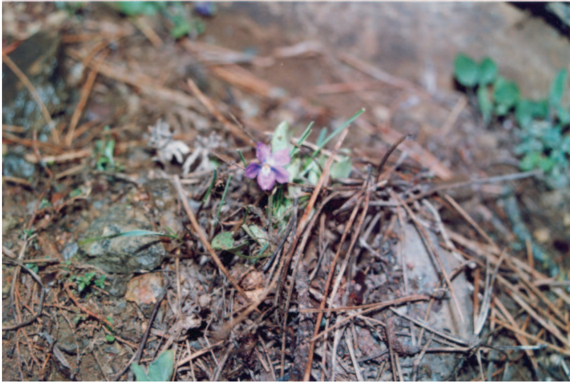
Figure 2. Viola yildirimli in the wild – in flower.