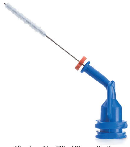
Fig. 1 NaviTip FX needle tip.

While activated using a smooth ultrasonic file (size #15 K-file, 0.02 taper) coupled to the file-holding adapter of a Satelec P5 Newtron XS ultrasonic system handpiece (Acteon Group, Merignac, France), 10 mL of 2.5% NaOCl was continuously delivered into the canal. The ultrasonic file was inserted into the 1 mm short of the WL without touching the walls, enabling it to vibrate freely. The irrigant was passively activated for 1.5 min at power setting 6 without engaging the file against the dentinal walls.