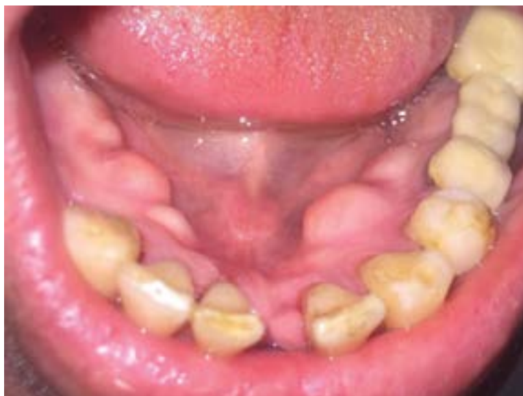
Figure 1. Bilateral mandibular tori.

important in jaw bones because of its relevance to implant planning and follow-up [12, 17].