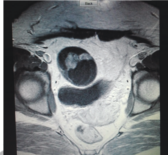
FIGURE 3: Pelvic MRI: the right adnexal mass.

The patient underwent a diagnostic laparoscopy for further evaluation of the adnexal mass. Biopsy of the adnexal mass and the liver was obtained and the pathologic examination revealed an ovarian mucinous cystadenocarcinoma with metastatic lesions of liver. The patient then was subjected to a laparotomy for a surgical staging procedure including total abdominal hysterectomy, bilateral salpingo-oophorectomy, bilateral pelvic and para-aortic lymphadenectomy, and infracolic omentectomy and appendectomy. Her postoperative course was uneventful and she was discharged at the 6th postoperative day. The patient was determined to have a stage IV ovarian carcinoma with brain metastasis. An adjuvant therapy including whole brain irradiation (a total dose of 30 Gy in 10 fractions and 3 Gy per fraction) with simultaneous dexamethasone and systemic chemotherapy (two lines of six cure 400 mg/m 2 carboplatin plus 175 mg/m 2 paclitaxel with three weeks interval) was administered postoperatively.