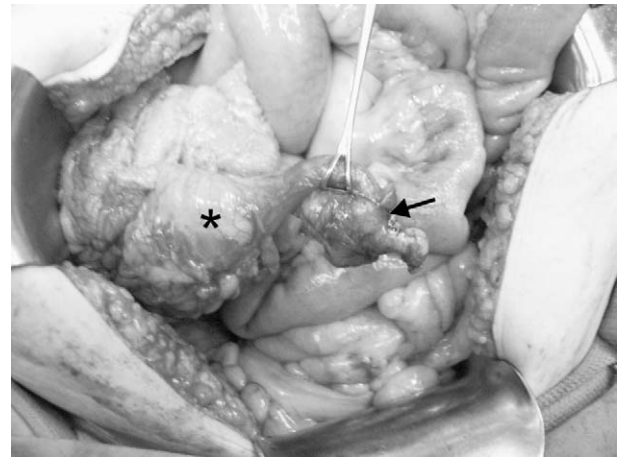
Figure 2 Asterisk shows cecum. Black arrow shows the inflamed, thickened appendix.

in some cases. The sensitivity and specificity of CT in detecting intra-abdominal pathology are between 88% and 98%, and 82% and 96%, respectively, in experienced centers. 5 Appendiceal tumors can mimic renal mass, ovarian carcinoma or other intra-abdominal invasive carcinomas. 6-8 When the age and presentation of our patients were taken into account, pessimistic expectations for neoplastic growth were to be anticipated.