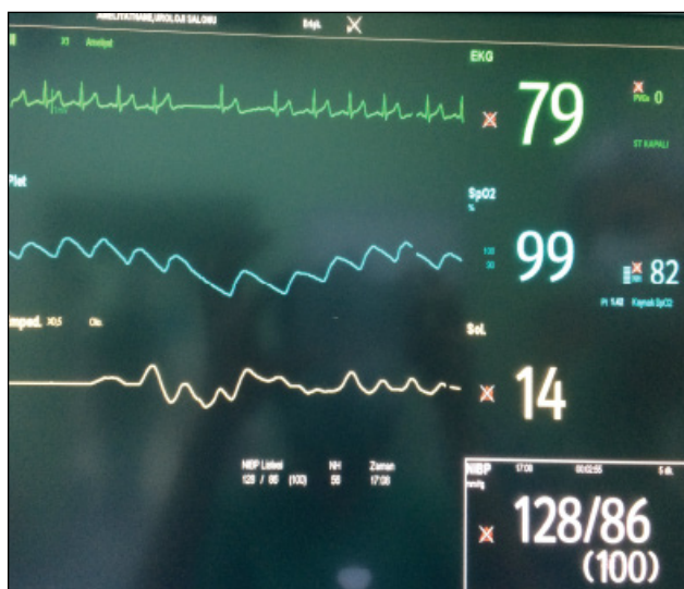
Figure 2. Intraoperative monitorization

Some anaesthetic agents are noted to have an association with ST segment elevations and can result in an increased risk of precipitating ventricular arrhythmias. The main course is early diagnosis to best prevent life-threatening arrhythmias and complications. There is a list of drugs ( www.brugadadrugs.org ) that are not recommended to be used to prevent cardiac death risk in patients with Brugada syndrome; for instance, propofol should be avoided. Moreover, many studies have been published regarding thiopental and its safe use. Kloesel et al. (4) published a case series and review regarding patients with Brugada syndrome. They noticed that ST elevation may occur after administering ketamine; however, thiopental did not have a similar effect. Ketamine and tramadol are the other drugs that should be avoided.