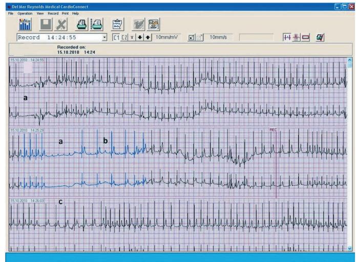
Fig. 1: The electrocardiogram recorded during a syncope revealed two short complete atrioventricular block attacks (a).

Atrioventricular blocks occurred without P-P cycle lengthening, and the PR interval remained stable before and at the end of the pauses. The family refused permanent pacemaker implantation. The patient was followed, and at the last