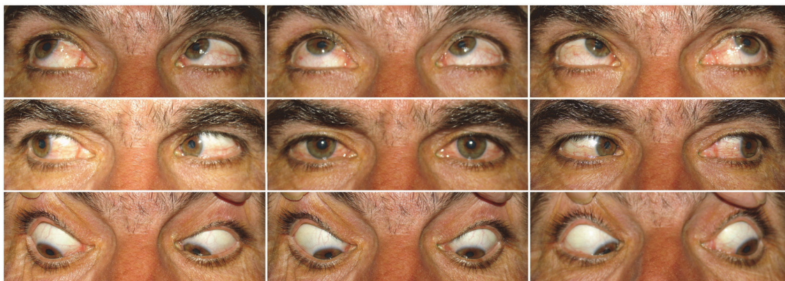
FIGURE 2: Nine cardinal photographs of patient number 3 after botulinum toxin injection.

alignment in all patients described to date [5]. The patients in this series represent this group. Type 3 AACE (Bielschowsky type) is characterized by acute onset of esotropia in patients with uncorrected myopia of -5.00 diopters or more, presumably following physical or mental stress [24]; subsequent reports have emphasized that good binocular function can be maintained in these patients with prisms [5].