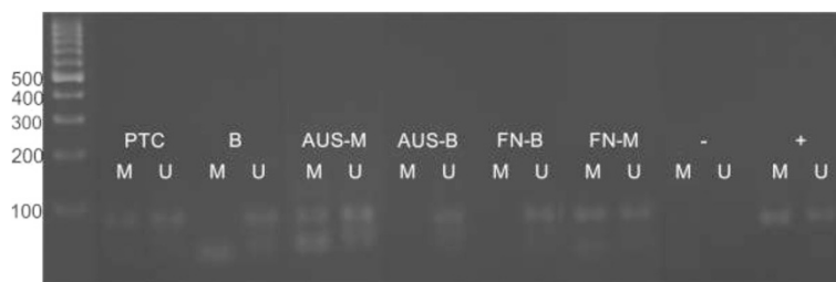
Fig. 1 Electrophoresis gel appearance of TSHr methylation status

The highest rate of TSHr methylation was found in the PTC group (13/15, 87 %), it was 44 % (7/16) in B, 61 % (17/28) in AUS and 30 % (3/10) in FN ( p = 0.016 , Fig. 2). There were no cases of follicular adenomas with a positive methylation status of TSHr (0/4) whereas in 3 of 6 (50 %) follicular carcinomas TSHr's were found to be methylated. Papillary thyroid carcinomas (PTC group) significantly showed higher TSHr methylation status than benign colloid nodules (B group, p = 0.013 ) and follicular adenomas (FN-B, p = 0.004 ) do; but no higher than in follicular carcinomas (FN-M, p = 0.115 ) or in AUS ( p = 0.096 ). In PTC group, all 9 cases showing lymph node metastasis had positive methylation status of TSHr. There was no significant difference between subgroups of atypia of unknown significance ( p = 0.934 ). TSHr of follicular