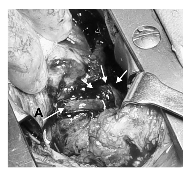
Figure 3 Surgical appearance of the seroma formation and anterior angulation of the PTFE graft shown in this figure. Arrow A is showing an angulated and functioning m-BT shunt due to posterior compression by a large seroma formation.

Since 1976, polytetrafluoroethylene graft (Gore-Tex®) was used for modified Blalock—Taussig shunt in congenital cardiac disease. In the literature, several complications of the m-BT shunts such as thrombosis, aneurysm formation, hematoma and perigraft seroma were reported. The incidence has been reported as 6.8—9.5% following peripheral graft material, and 18.8% ratio has been reported after m-BT shunt procedure. A perigraft seroma is defined as a sterile collection of fluid in a non-secretory wall surrounding a shunt. However, the cause of seroma formation is not clear