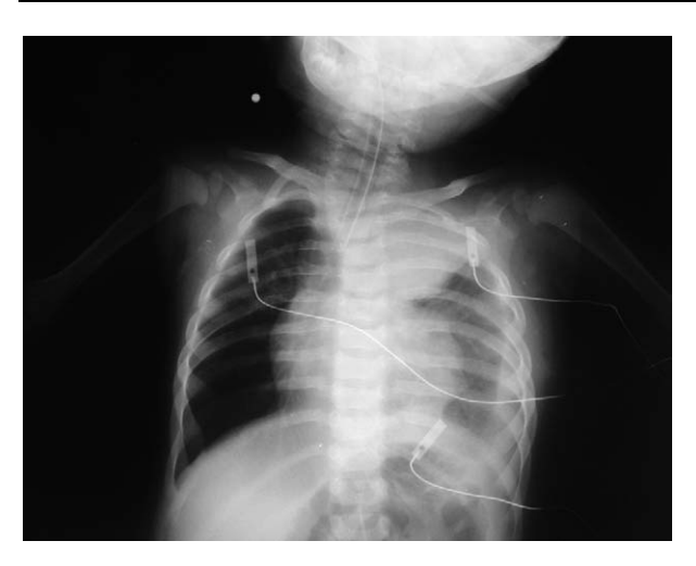
Figure 1 X-ray film showing a large and well demarcated mass in the chest of the left upper mediastinum.

Chest X-ray showed the enlargement of the mass and blood gas oxygen saturation was decreased and the patient could not be extubated after two days from entubation, and because of progressive decrement of the arterial oxygen saturation and developing signs of respiratory distress, she underwent urgent re-thoracotomy.