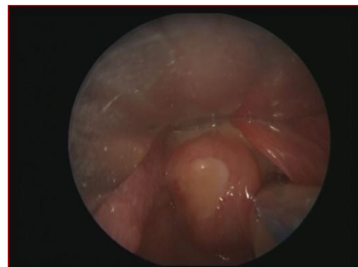
Figure 1: Laryngoscopic appearance of laryngeal cyst

A 2900 g, term male newborn, with history of maternal polyhydramnios was admitted to the NICU because of severe cyanosis and respiratory insufficiency that developed immediately after birth. During intubation, a large laryngeal mass was noted. Laryngotracheobronchoscopy (LTB) under general anesthesia revealed a cystic mass in the left supraglottic region of the larynx (Fig. 1). The cyst was punctured and the mucoid fluid drained by suction to prevent aspiration. In the next few days after extubation, progressive inspiratory stridor developed. A second LTB showed a large recurrent cyst.