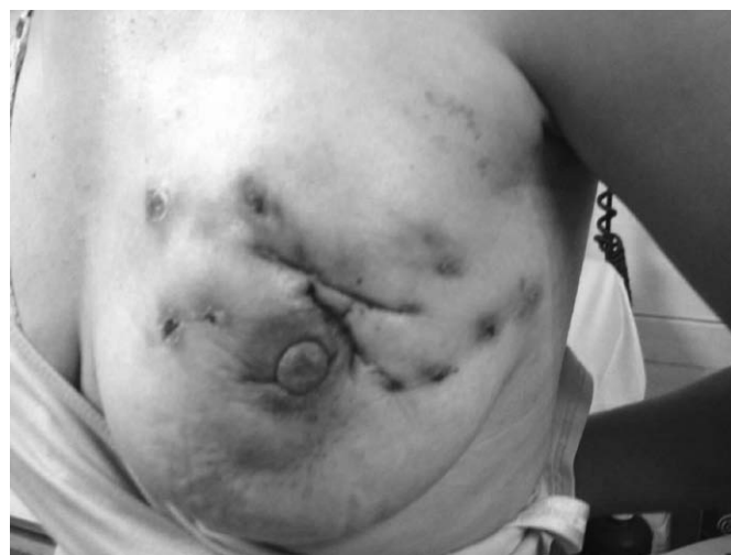
Fig. 2. Non-healing wounds and fistula formation in a patient with granulomatous mastitis..

The etiology of IGM is unclear. Some mechanisms proposed in the literature include a chemical reaction associated with oral contraceptive use, an underlying autoimmune process, an infectious process that cannot be detected by current