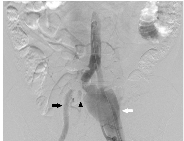
Fig. 2. DSA image reveals AVF between right common iliac artery (black arrow) and left common iliac vein (white arrow) at the bifurcation of iliac artery. Proximal right internal iliac artery also contributes to the AVF (arrowhead).

Abdominopelvic DSA, obtained via left femoral approach, revealed an AVF between right common iliac artery-left common iliac vein at the bifurcation of the iliac artery. The proximal part of the right internal iliac artery was also contributing to the fistula (Fig. 2). The right internal iliac artery was embolized with 8 mm Amplatzer Vascular Plug 4 for prevention of endoleak and retrograde flow to the fistula after stent graft implantation. A self-expanding Endurant II 16-10-93 mm stent graft deployed from common iliac artery to right external iliac artery. Control DSA after