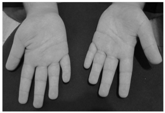
Fig. 1. The patient's fifth fingers are short bilaterally.

Neurological manifestations in KS are usually characterized by hypotonia, mental retardation and epileptic seizures. Approximately 10-39% of these patients are reported to have seizures<sup>12,13</sup>, most of which are localizationrelated and have a favorable outcome<sup>14, 15</sup>. The onset of seizures can vary between neonatal period and 15 years<sup>13,14</sup>. Most of the electroencephalographic studies have revealed posteriorly located focal spikes<sup>16</sup>, despite recently reported fronto-central predominance in several patients<sup>15</sup>. Cranial MRI results can be normal<sup>14</sup> or indicate various findings such as mild cerebral atrophy with enlarged