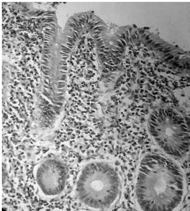
Figure 2 Colonoscopic biopsy specimen that shows neutrophilic infiltration of the lamina propria consistent with colitis.

characterised by polyneuropathy, organomegaly, endocrinopathy, monoclonal gammopathy, and skin lesions. 3 Our patient fulfilled all of the above mentioned characteristic criterias and the diagnosis of POEMS syndrome was made.