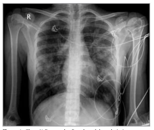
Figure 1. Chest X-Ray on the first day of the admission.

A large number of microbiological and immunological assessment of blood, stool and urine samples were performed and resulted all negative. Also viral antibody tests were negative. The patient was seronegative for human immunodeficiency virus (HIV). On the third day of admission, bronchoscopy was performed and revealed swollen reddened respiratory tract with diffuse purulent secretion. The leukocytes in the bronchoalveolar lavage (BAL) fluid were 6% eosinophils and BAL fluid cultures resulted as negative.