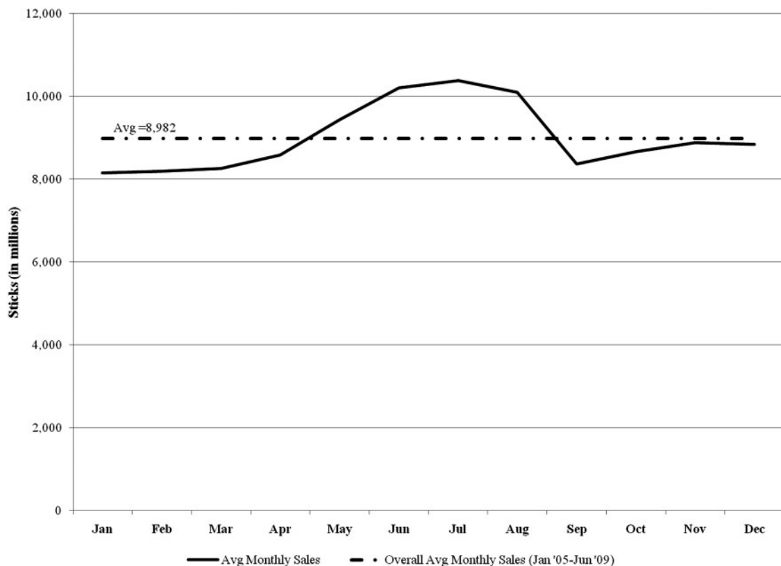
Figure 1 Monthly pattern of tobacco consumption

period when new tobacco control measures were implemented) (figure 2). Divergence by the actual sales pattern from the expected pattern was then discussed.