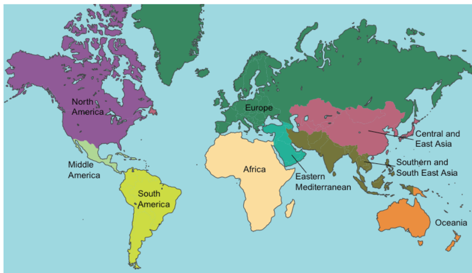
Fig. 2. Areas and sub-areas of the world (from reference 3).

In parallel with the growth of the organization, ISPRM decided during the 2011 Congress in Puerto Rico, to end relations with the previous Central Office and to look for a new man-