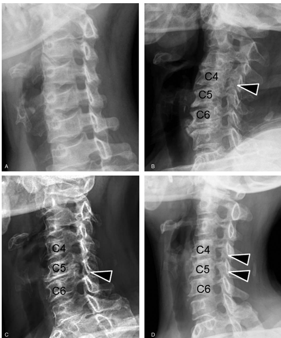
Figure 3. Cervical radiographs (oblique view) with (A) no C4/5 or C5/6 foraminal stenosis, (B) C4/5 foraminal stenosis only, (C) C5/6 foraminal stenosis only, and (D) both C4/5 and C5/6 foraminal stenosis. The arrows indicate the stenotic foramina.

pain of an undifferentiated shoulder or cervical origin, the prevalence of rotator cuff tendon tears is not higher than in the general population with shoulder pain.