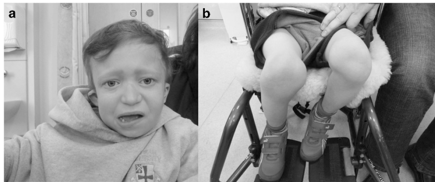
Figure 3 Study patient 49 who shows typical features of genitopatellar syndrome. Note in 3a that blepharophimosis is less apparent, and in 3b the knees are held in flexion and the patellae are displaced and hypoplastic.

haploinsufficiency. (b) Variants that are not subject to NMD but cause a more severe GPS phenotype if they affect critical binding sites of KAT6B . (c) variants that occur more distally and again escape NMD but cause the SBBS phenotype rather than GPS, as they do not interfere with the critical binding sites associated with GPS. All of these three groups could share common features if, as Campeau suggest, haploinsufficiency for the very distal C-terminal region is crucial, but it is also possible that the more distal variants are also contributing to a more severe SBBS phenotype due to a gain-of-function effect. Further studies of the individual sequence variants are needed to clarify the mechanisms involved. KAT6B deletions have been documented very rarely in the literature; Tzschach et al 12 described four patients with 10q22 deletions encompassing KAT6B . They had a mild phenotype with common features of hypotonia and developmental delay, especially in the area of speech. Facial features were nonspecific, though on scrutiny of the available photographs, blepharophimosis did appear to be a feature. Interestingly, one of the patients was noted to have unusually long and straight thumbs. The DDD study (DECIPHER@sanger.uk) 13 identified a patient, DECIPHER number