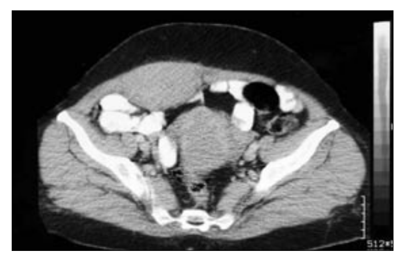
Figure 4. CT scan of rectus sheath hematoma (patient 4).