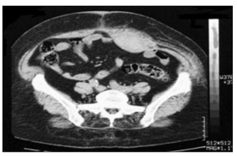
Figure 3. CT scan of rectus sheath hematoma (patient 3).

Accurate diagnosis and differential diagnosis should be made carefully to avoid unnecessary surgery and to get early appropriate treatment. So early