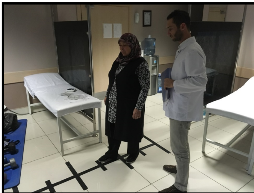
Figure 3.1. Timed up and go test application

6 Minute Walking Test: The functional capacities of the individuals studied were evaluated with the 6 Minute Walking Test (6-MWT). 6-MWT is a simple test that measures the distance that an individual can walk on a flat, hard surface in 6 minutes. People were asked to walk as long as possible for 6 minutes in their own rhythm. The distance covered in six minutes was recorded in "meters" (69, 70).