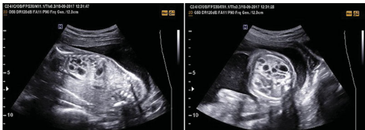
Fig. 1 Prenatal ultrasonographic features of a CPAM case in our series.

The mean maternal age in these 19 cases was 27.5 (19–37 years). We observed that 68.4% (13 out of 19) of the