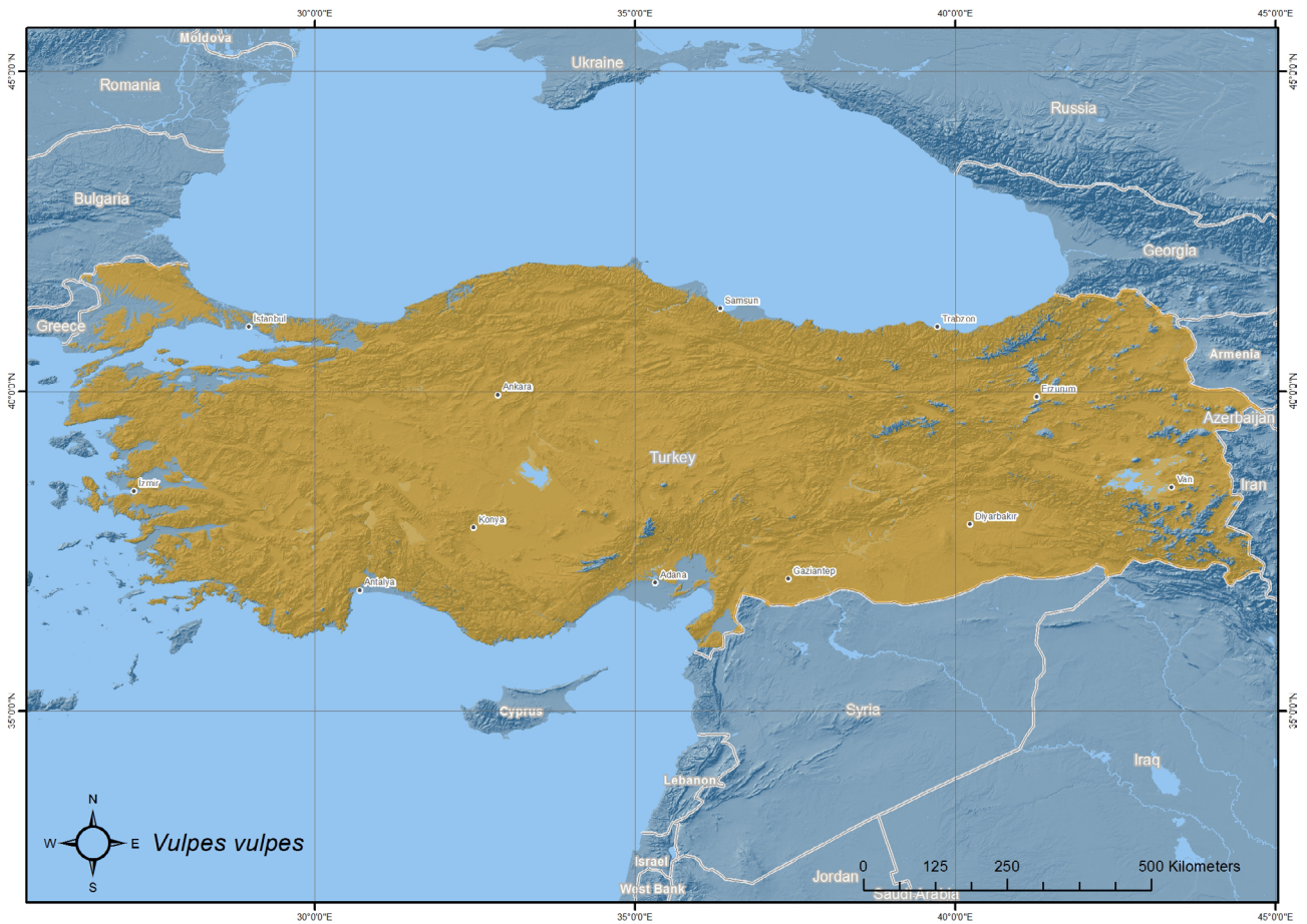
Figure 4. The distribution map of red fox.

rabies among red fox populations towards eastern parts of Anatolia (Johnson et al., 2010). Despite recent vaccination studies for red fox (Vos et al., 2009), strict control strategies should be considered to prevent the spread of rabies among wild species in Anatolia. Red foxes with Helicobacter spp. (Erginsoy et al., 2004) and infected by zoonotic agents such as helminth and arthropod species (Gıcık et al., 2009) were reported from the province of Kars. Red foxes with mange were also documented based on camera-trapping records in the Western Black Sea region of Anatolia (Soyumert, 2010). The roughly estimated population size is about 16,000 to 20,000 individuals at least. Therefore, the status of red fox was defined as LC according to IUCN criterion C and the red fox population has been showing an increasing trend (IUCN, 2001).