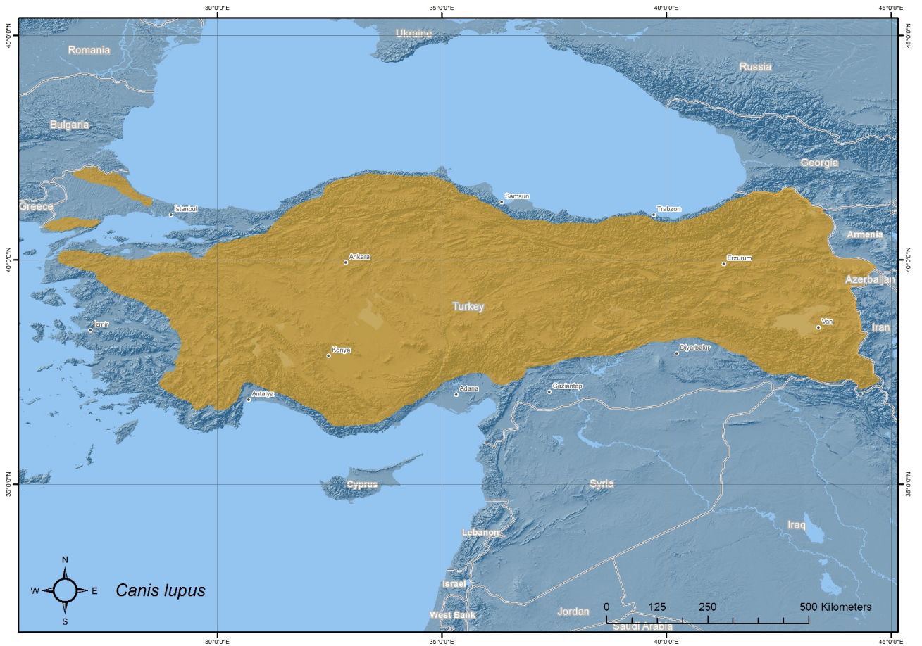
Figure 2. The distribution map of gray wolf.

A recent diet analysis in Northeastern Turkey showed that wolves not only prey upon livestock but also have them as their main diet item (Capitani et al., 2015). However, the results of other field studies in Kastamonu, Ankara, and Artvin revealed that livestock depredation was not so intense and wolves mainly preyed on wild boars and available ungulates (unpublished data). When