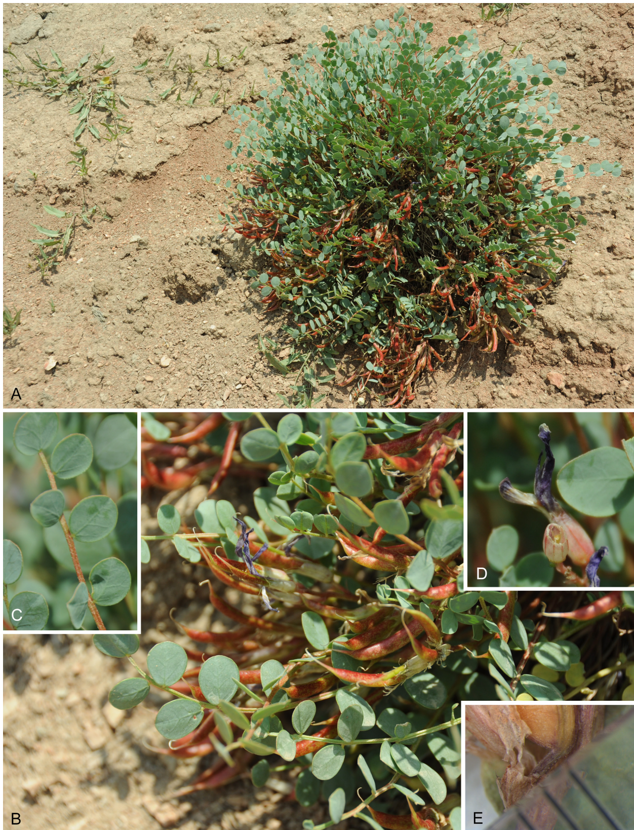
Fig. 1. Astragalus ihsanalisii – A: habit of fruiting plant; B: leaves and infructescences; C: part of leaf, adaxial surface; D: flowers, one truncated; E: stipe of legume. – Type locality, 26 June 2015, photographed by A. A. Dönmez.