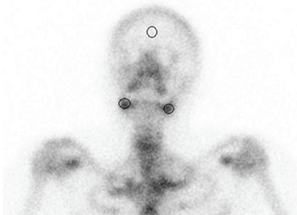
Fig. 1. Regions of interest drawn on the scintigram to indicate extraction socket regions and the frontal bone of calvarium.