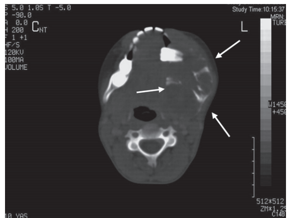
Fig. 3. Bone windows of CT images showing expanding and destructive mass on the left mandible.