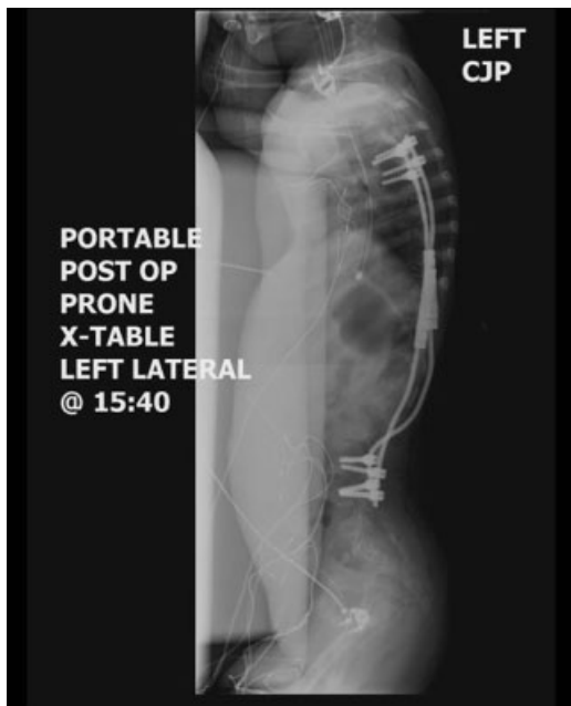
Fig. 4 Patient 2 postoperative lateral view. Abbreviations: post op, postoperative.

We identified three patients who met inclusion criteria for this study (►Table 1). All three patients had growing rods implanted; no patients with VEPTR instrumentation were