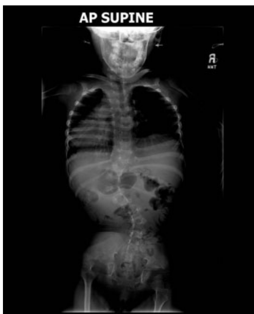
Fig. 1 Patient 2 preoperative supine anteroposterior view (90 degrees T11–L3). Abbreviation: AP, anteroposterior.

Patients were positioned in the prone position on a radiolucent Jackson table over gel bolsters to allow the belly to hang freely. Neurophysiological monitoring modalities employed included somatosensory evoked potentials (SSEP), motor evoked potentials (MEP), and triggered electromyography (EMG) stimulation of neural elements and