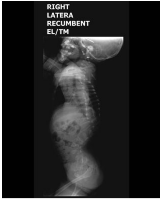
Fig. 3 Patient 2 preoperative recumbent lateral view. Note thoracolumbar kyphosis.

scoliosis. Inclusion criteria were identical to the inclusion criteria of our study group.