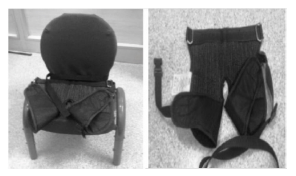
Fig. 1. The adaptive chair and hip positioning belt

Position of the child : Hips were at approximately 90° flexion, 10-20° abduction and external rotation symmetrically with the back of child positioned fit to the chair. The desk was