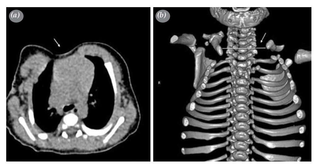
Figure 1. Thorax computed tomography (a) and three-dimensional reconstruction (b) views of defect.

extremities of the right and left ribs, covered by skin. The beating heart was visible through the skin. The examination of the rest of the body and the laboratory tests were normal. A written informed consent was obtained from the legal guardians of the patient.