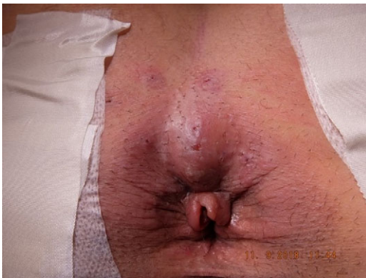
Figure 1: Proctologic examination revealed a painful swelling on the posterior midline, around which the leech bites could be seen.

The discovery in 1884 of hirudin, an anti-coagulant substance in leech saliva, led to increased popularity of hirudotherapy for the treatment of venous insufficiency, varicose veins, hemorrhoids and other venous diseases. It is not surprising that proponents of alternative medicine lust for such methods, which usually lack scientific evidence for efficacy and safety, and therefore, do not exist in guidelines. The only reported series from India of leech application in thrombosed hemorrhoids also harbors severe methodological errors [5]. It is noteworthy that our public insurance system recently validated and started to pay for such applications. Our patient had undergone leech treatment in a medical center by a young practitioner who was not a surgeon or proctologist, at all. This is, unfortunately, a growing trend in this part of the world where easy gain without acquisition,