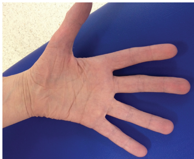
FIGURE 1 Distal myopathy of cystinosis, with atrophy of the thenar and hypothenar eminences

Other complications of cystinosis include a distal vacuolar myopathy (Figure 1), exocrine and endocrine pancreatic dysfunction, benign intracranial hypertension, and retinal