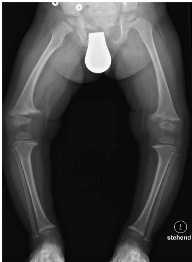
FIGURE 2 Active rachitic bone disease on X-ray of both legs. Note reduced bone density, widening of the metaphyses, and fraying of the epiphyses

blindness, 21 often causing restrictive lung disease and/or swallowing difficulty. 22 Most complications can be prevented with early and lifelong cystine-depleting therapy.