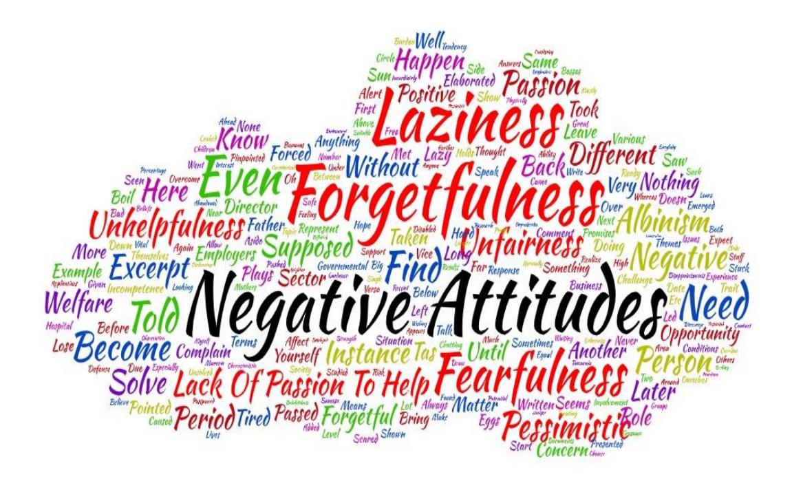
Figure 5: Social Services Professionals' negative attitudes towards PWA