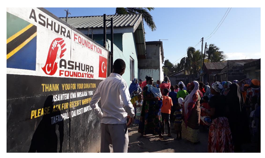
Plate 4: The Ashura Foundation