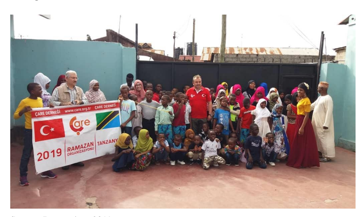
Plate 5: Remedy Aid And Development Association ( Çare Yardımlaşma ve Kalkınma Derneği )