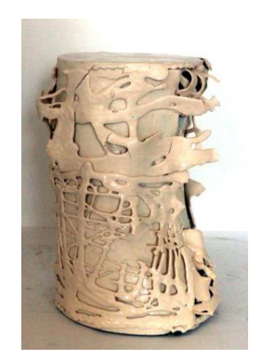
Fig.5(a),(b) The artworks example for the abstract forms