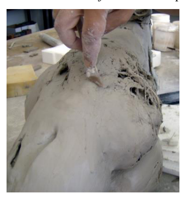
Fig. 2. Forming process of a figure

This project report's introduction is composed of explanation of this point of view and how art is expressed on subjects those can give a bad sense at first sight, such as social disasters, wars, diseases. And of course why ceramic art is also associated with such subjects and how these subjects can be expressed by ceramic in an artistic way.