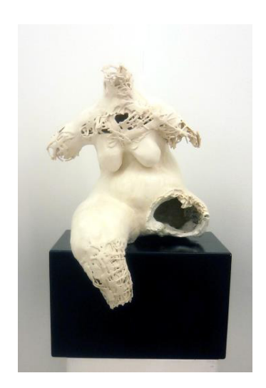
Fig. 6(a),(b). Examples of osteoporotic figures

After finishing the theory part as a report and art objects 5 jury members invited for final exam which takes minimum two hours. The first part of exam included artist's presentations and visiting the art objects in exhibition hall. Second part of exam is asking questions about title and suggestions of every part of study one by one each jury members. After her jury and exam she had a solo exhibition at an public art gallery is Gozubuyuk and she had an award in a national ceramic competition in 2012 with one of her works and she joined several national and international exhibitions with the same idea and subject too.